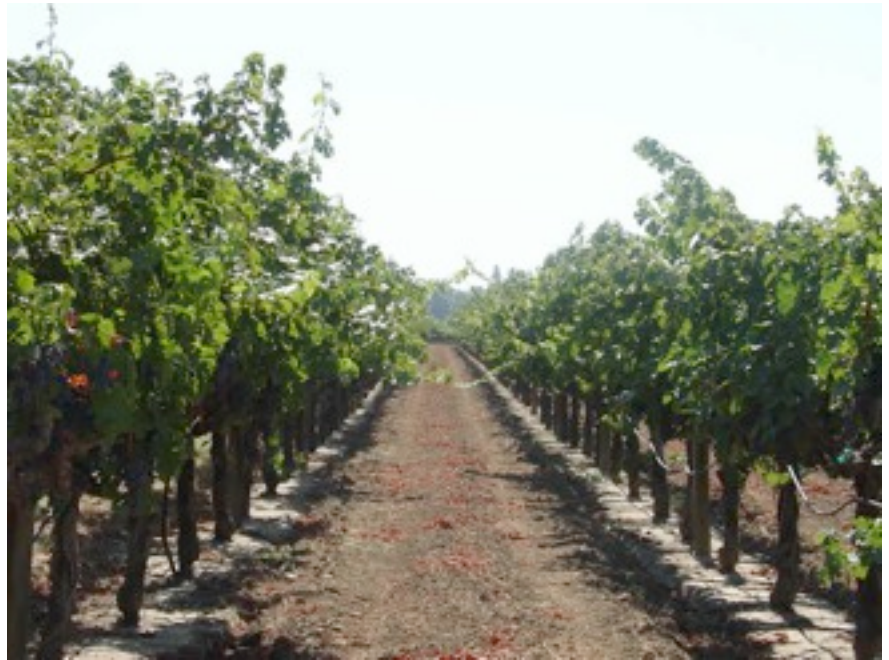
Napa growers combine cutting-edge science with traditional techniques