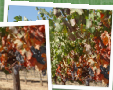
Napa Vineyard, Napa, CA